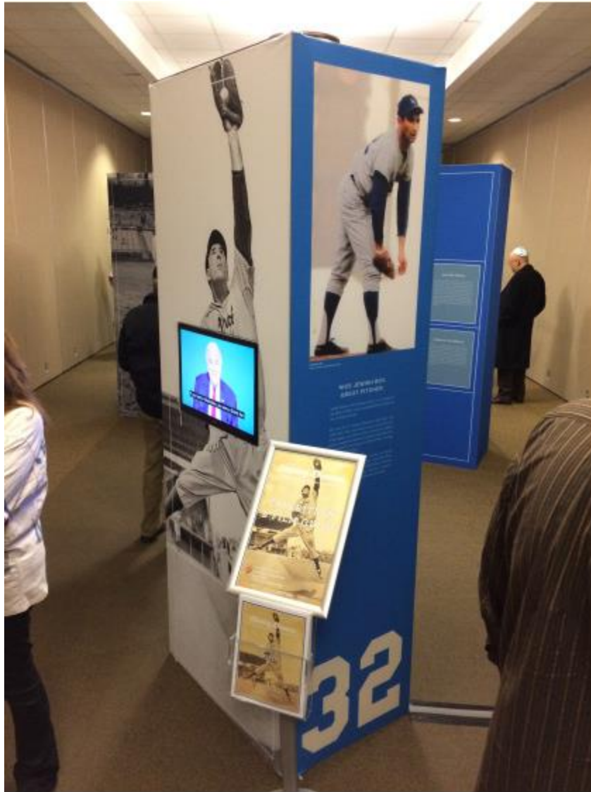
Chasing Dreams exhibit

During an opening event on Saturday, January 7, former American League President and the last surviving member of the 1947 New York Yankees, former third baseman, Dr. Bobby Brown visited the exhibit and shared stories of his time as a Yankee and becoming a cardiologist in Fort Worth after his baseball career.