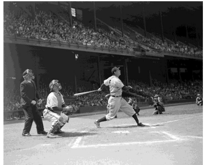
Hank Greenberg connects with the ball for a third inning homer against the Philadelphia Phillies, 1947