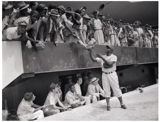
Jackie Robinson signs autographs on the first day of Spring Training, 1948

players, scouts, broadcasters, journalists, novelists—and especially, fans. Chasing Dreams explores how baseball has served as an arena in which values, identity, ethnicity, and race have been projected, contested, and occasionally solidified. It poses questions such as: Why have so many immigrant groups and minority communities identified with, taken pride in, and felt connected to the nation's pastime? Did baseball impact how American Jews established affinities with other racial and ethnic minorities? What does it mean that Jews consider Jackie Robinson to be one of their own heroes?